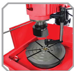
Head locking handle

GET READY FOR TAX TIME WITH AN INSTANT ASSET WRITE-OFF