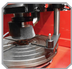
Cup grinding wheel & rotary table