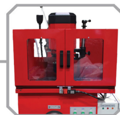
Safety barrier (2S model - Door style guard pictured)