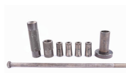
DOWEL PIN PULLERS