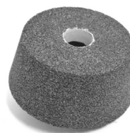
WET AND DRY GRINDING STONES