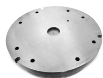
MAGNETIC TABLE (-2 MODELS ONLY)