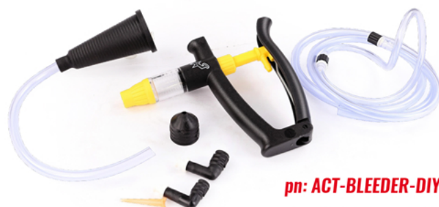
pn: ACT-BLEEDER-DIY (available from ACS)