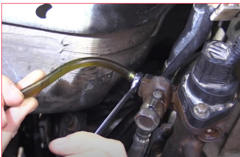
Replacement slave cylinders also available from ACS (pn: SCGM025)

"Our mission is to provide the highest Quality, Innovation & Service to our customers across Australia and around the world"